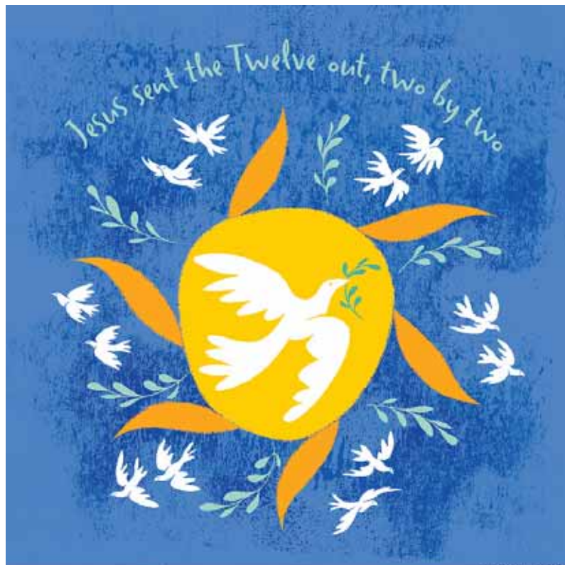
© J. S. Patsch Co., Inc.

Pray for Peace and the reuniting of immigrant families swiftly and safely.