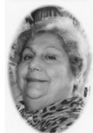
In Loving Memory of Antoinette A. DiFiore

TO APPLY FOR THE SCHOLARSHIP , please write a 500 word essay, double spaced (no more than 2 pages), about ... (Cont. on page 4)